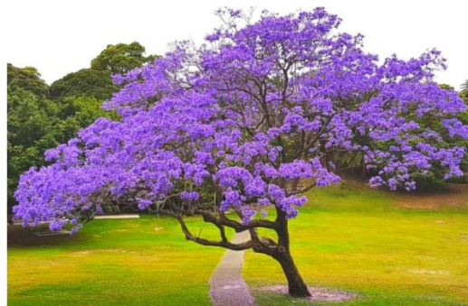
Figure 2: Jacaranda Tree

While you are enjoying the smells of spring, please take advantage of the many wonderful events happening in our community.