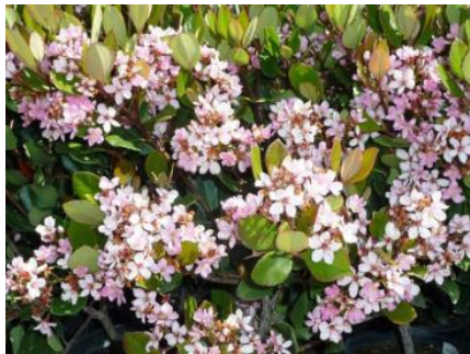
Figure 1: Pink Lady Rhapsody

Ah, the smells of spring are in the air. The roses are blooming in abundance, the jasmine is beginning to flower, and the Pink Lady Rhapsody are in full bloom. While we do not have them in the Cays, the Village of Coronado features beautiful Jacaranda trees, which appear to be blooming a bit early this year. Originally native to Argentina, these trees were introduced to Balboa Park in the late 1800s by botanist Kate Sessions. There is no finer time to be in Coronado.